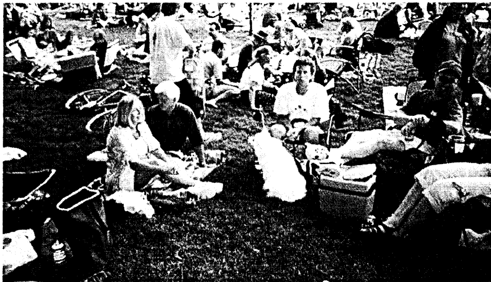
Jazz on the Green—Thursdays through August 15