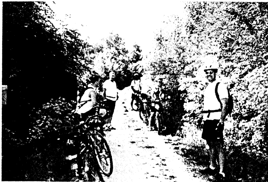
Resting in the shade on the Wabash Trace