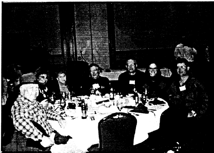
OSC Members at the USRSA Awards Banquet

DEADLINES NEAR FOR TAHOE AND FSA/COPPER MOUNTAIN TRIPS--SEE INSIDE FOR MORE DETAILS