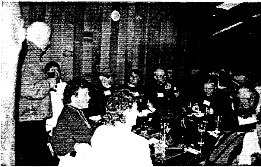
(Above) USRSA Apres-Ski Party—Park City, January 2002