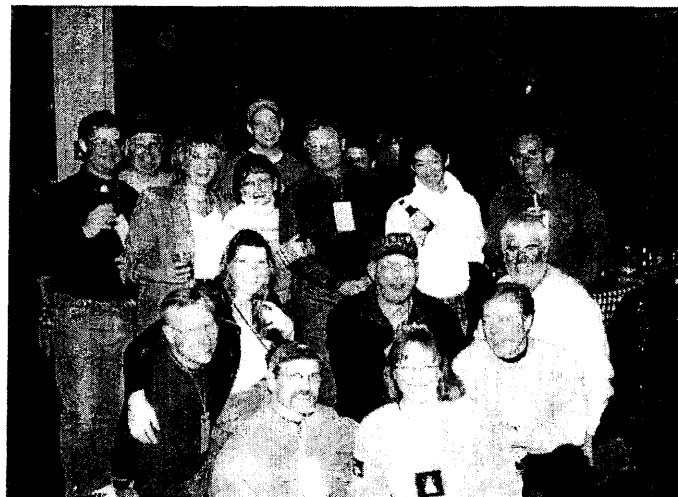
Team OSC at the awards banquet