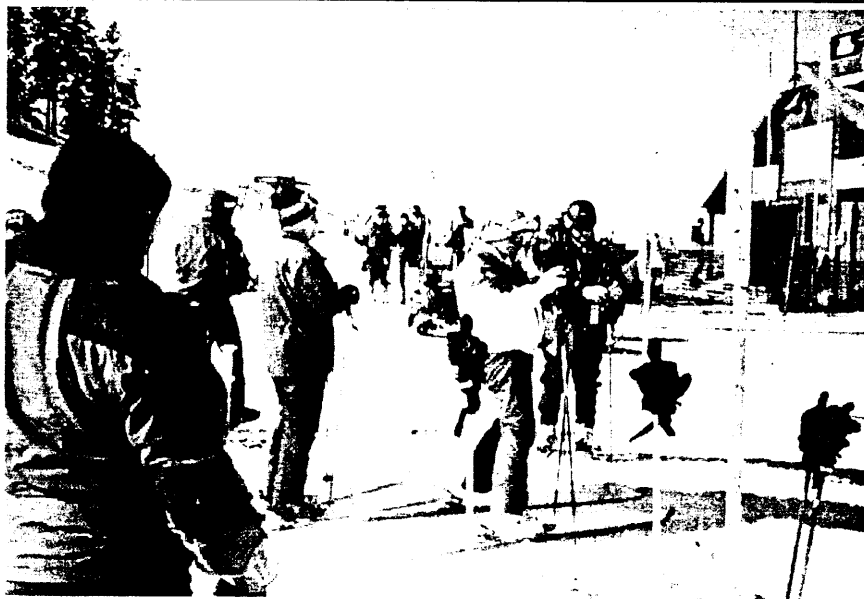
Waiting at the top of the race course