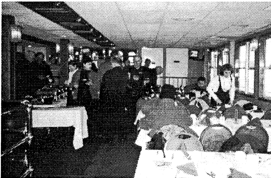
(Below) Breakfast on the Tahoe Queen