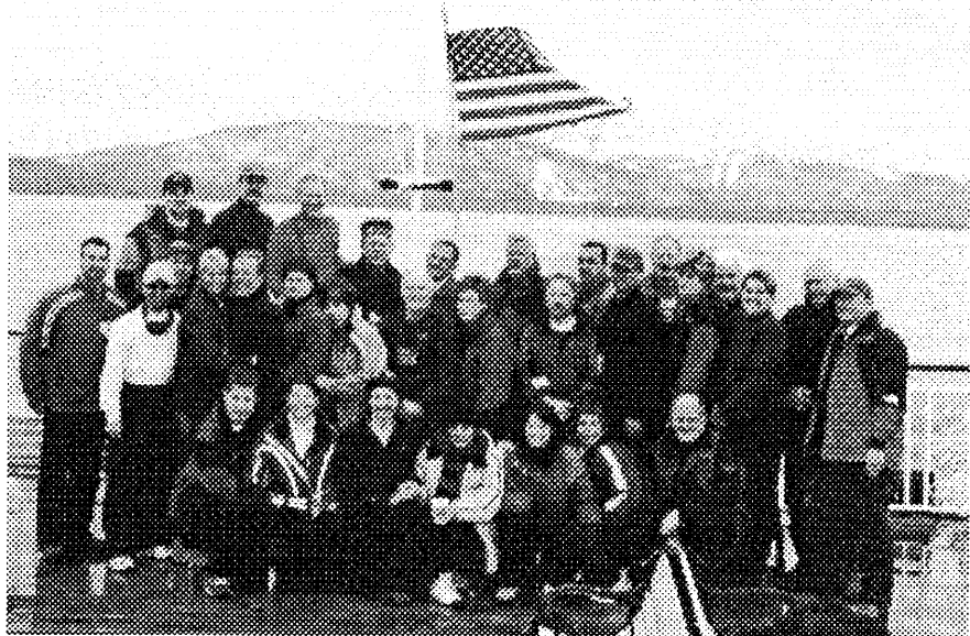
OSC members sail to Squaw Valley on the Tahoe Queen Tahoe Trip, February 12, 2003