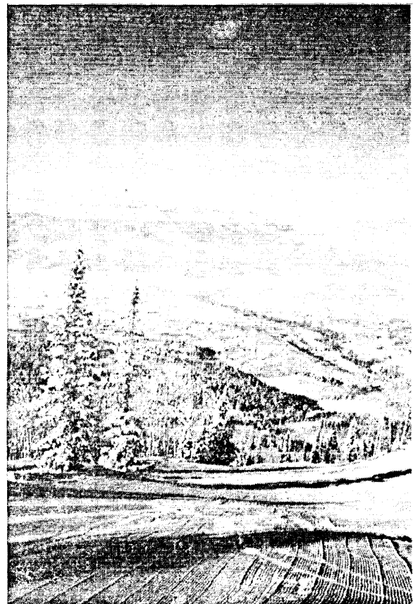
Steamboat, CO – our first ski destination this year