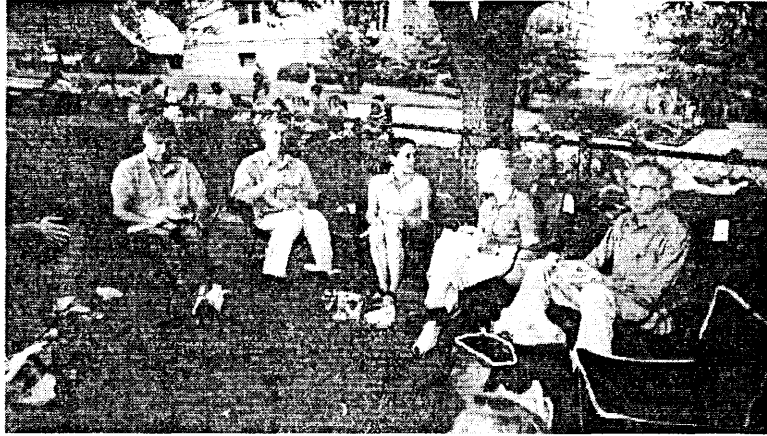
Relaxing at Jazz on the Green