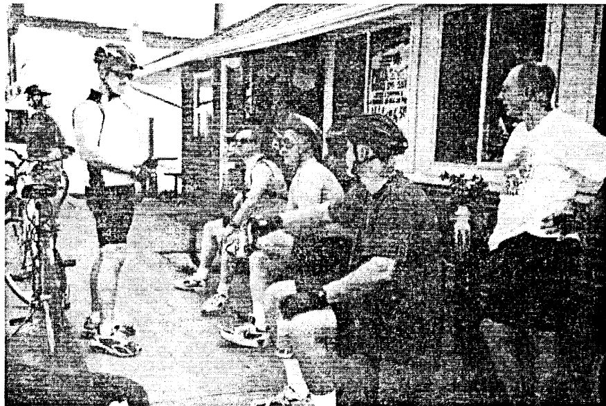
Resting at Silver City on the Wabash Trace