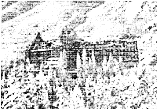
The Castle in the Forest