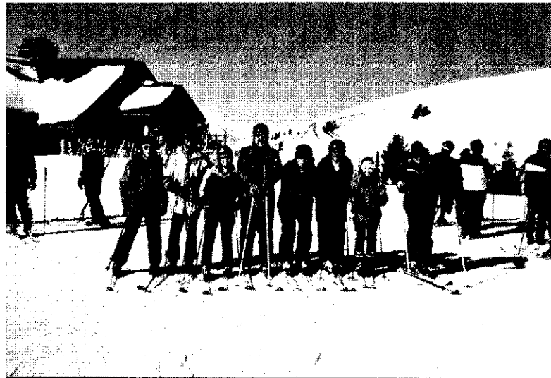
Skiers at Seattle Ridge summit