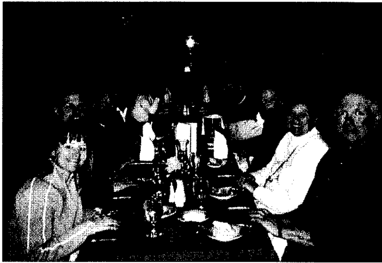
Group dinner at the Ram Restaurant

[OSC USE ONLY] MEMBERSHIP NO. _____ BD. _____ TR. _____ NL. _____