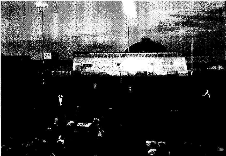
Omaha Royals Baseball