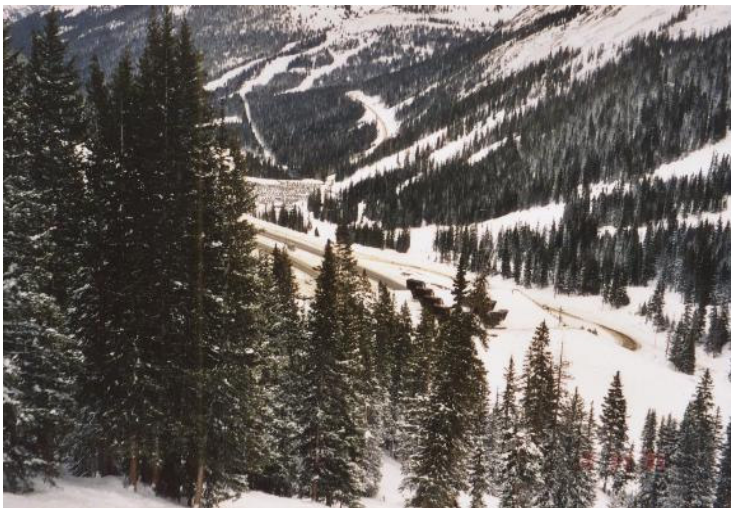
Eisenhower Tunnel Air Vents