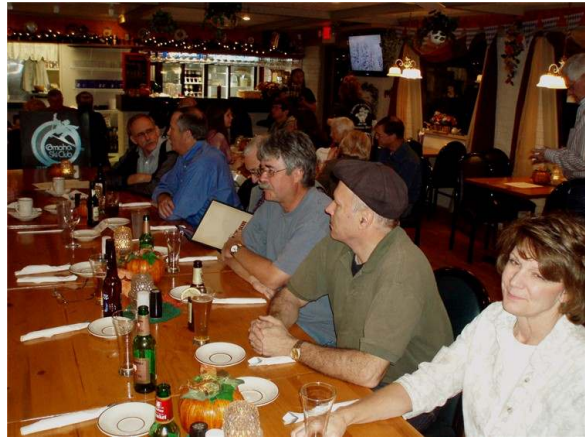
Discussion at the long table, part 2