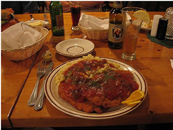
Zigeunerschnitzel with German noodles and beer