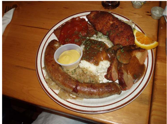
Bratwurst, sauerkraut, pork and gravy