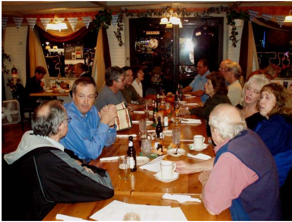
Discussion at the long table, part 1

On Friday, October 22, fifteen Omaha Ski Club members convened at the Zum Biergarten restaurant in northern Bellevue for an evening of unusual, exotic and tasty German food and beer. We also took advantage of the occasion to celebrate Roger's birthday. Some pictures from the dinner are shown below.