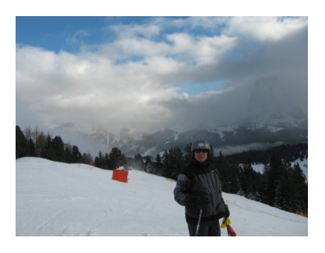
Our last skiing day was Friday, the 18th. This was another clear and cool day with moderate winds. We stuck to the main runs near and to the east of Selva and had a relaxing day in nice conditions.