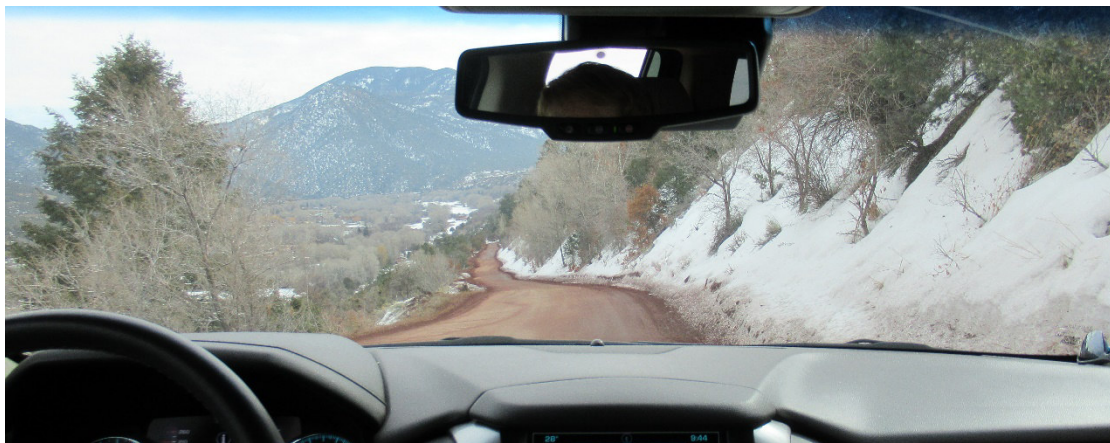
The narrow road on the “short-cut” to Taos Resort.