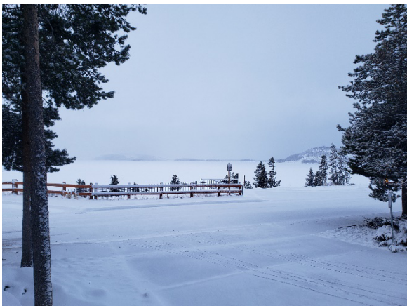
Lake Dillon view from the hotel