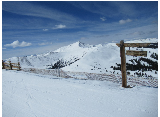
Jacques Peak from Hallelujah Ridge