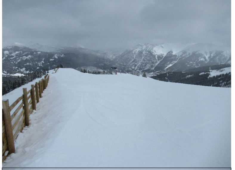
View from top of Sierra Lift